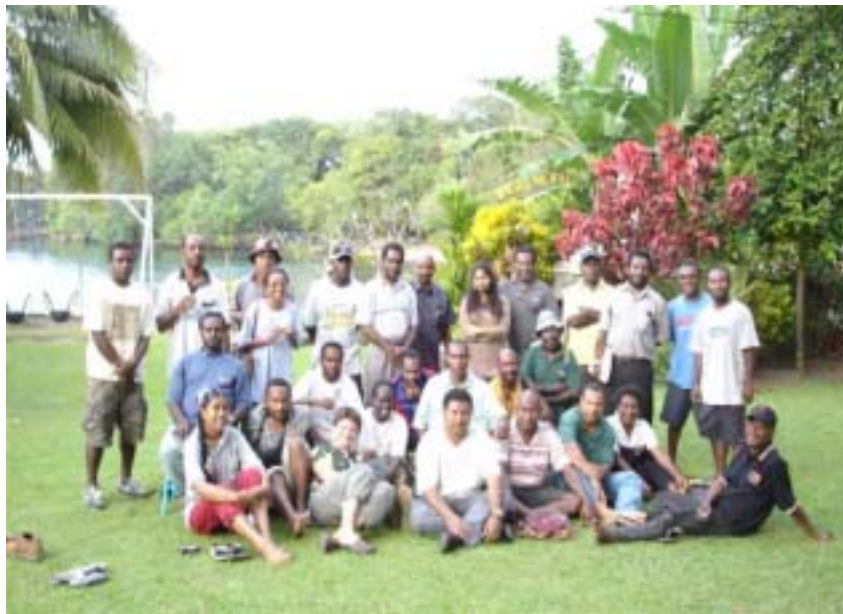
CELCOR Staff and partner CBO/NGO officers posing for photograph, Madang