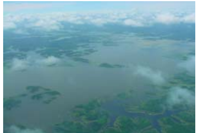
Birds eye view of Lake Murray

The group’s approach is to support the communities in the Lake Murray area of the Western province to sustainably manage their own forest resources.