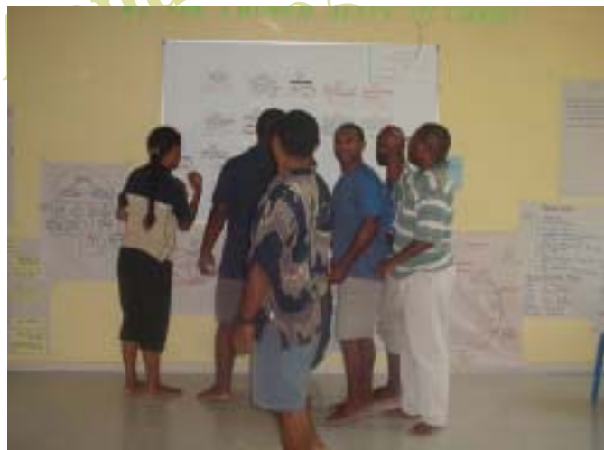
Reflecting the past: CELCOR staff at its Reflection workshop