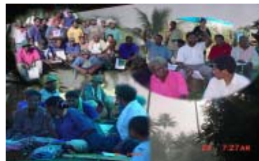
Scenes from Cloudy Bay community legal education workshop

The training of trainers is the outcome of the External Evaluation's recommendation to conduct true paralegal training. The training clearly define the environmental and conservations laws, inclusively, highlighting people's rights that are spelt out in the various legislation studied. The anticipated outcome of the workshop was to produce people who are able to carry out both the legal awareness and legal assistance to selected communities.