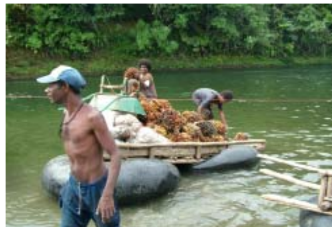
This Oil Palm grower from Oro uses make-shift raft from rubber tubes and planks to cross a river. Wheelburrows are used to carry the nut.

The PNG Eco Forestry Forum is one of the fora that CELCOR is member of. It addresses all Forestry issues in PNG and had major activities including a seminar, lobby trip and picketing for the new Forest Bill that was passed in the Parliament mid this year and the World Environment Day activities. It was realised after all the activities were done that CELCOR played a vital role in coordinating of the seminar, picketing and parliament lobbying. One of the underlying reasons was the fact that CELCOR had Campaigners while other NGOs did not and therefore had the opportunity to committee the available human resource.