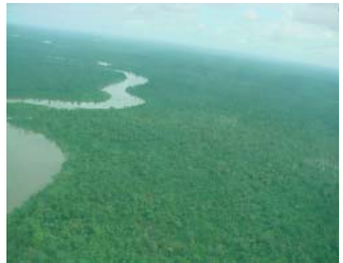
Land issues are the most contraversal in the history of mankind. Photo: Fly River Delta, Western Province

The program since it begun assisting groups to register last year (2004), has registered eleven CBO's throughout the country and continuously receives requests from various groups which are community orientated to assist them with their registration. The program is also instrumental in drafting Constitutions for these CBOs and or their Environmental Policies.